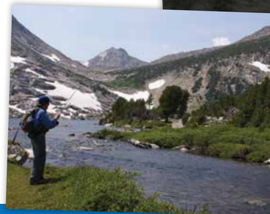
Caption will go here