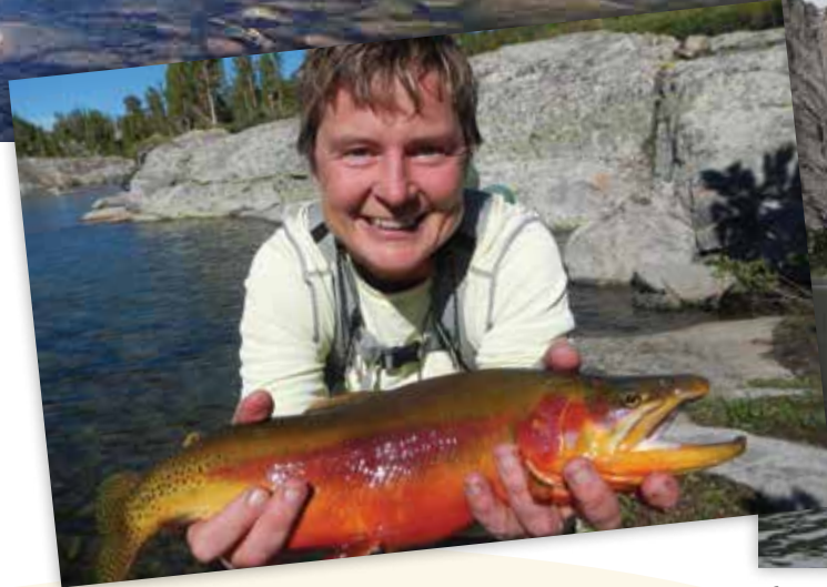
Caption will go here