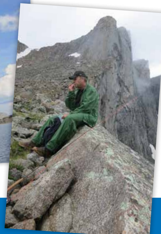
Caption will go here